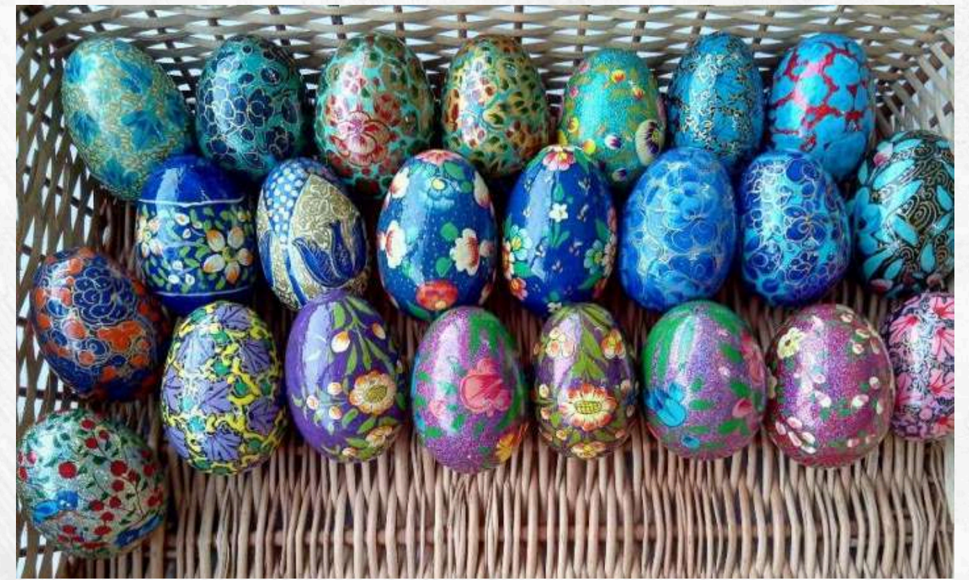
Name - Easter Eggs | Size - 7.5cm | Theme - Sustainable