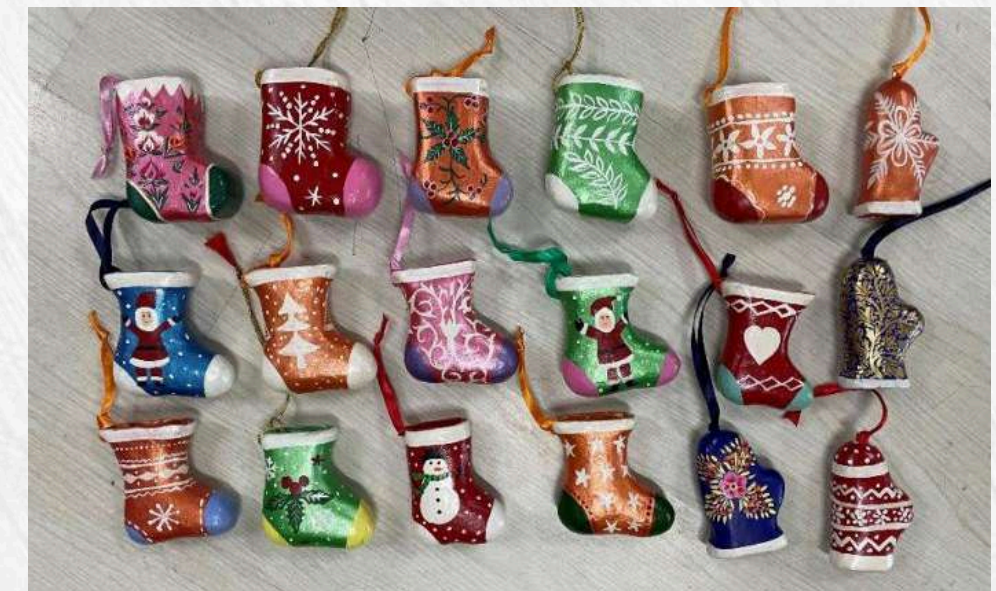
Name - Stockings Size - 8cm(big) & 7cm(small) Theme - Sustainable