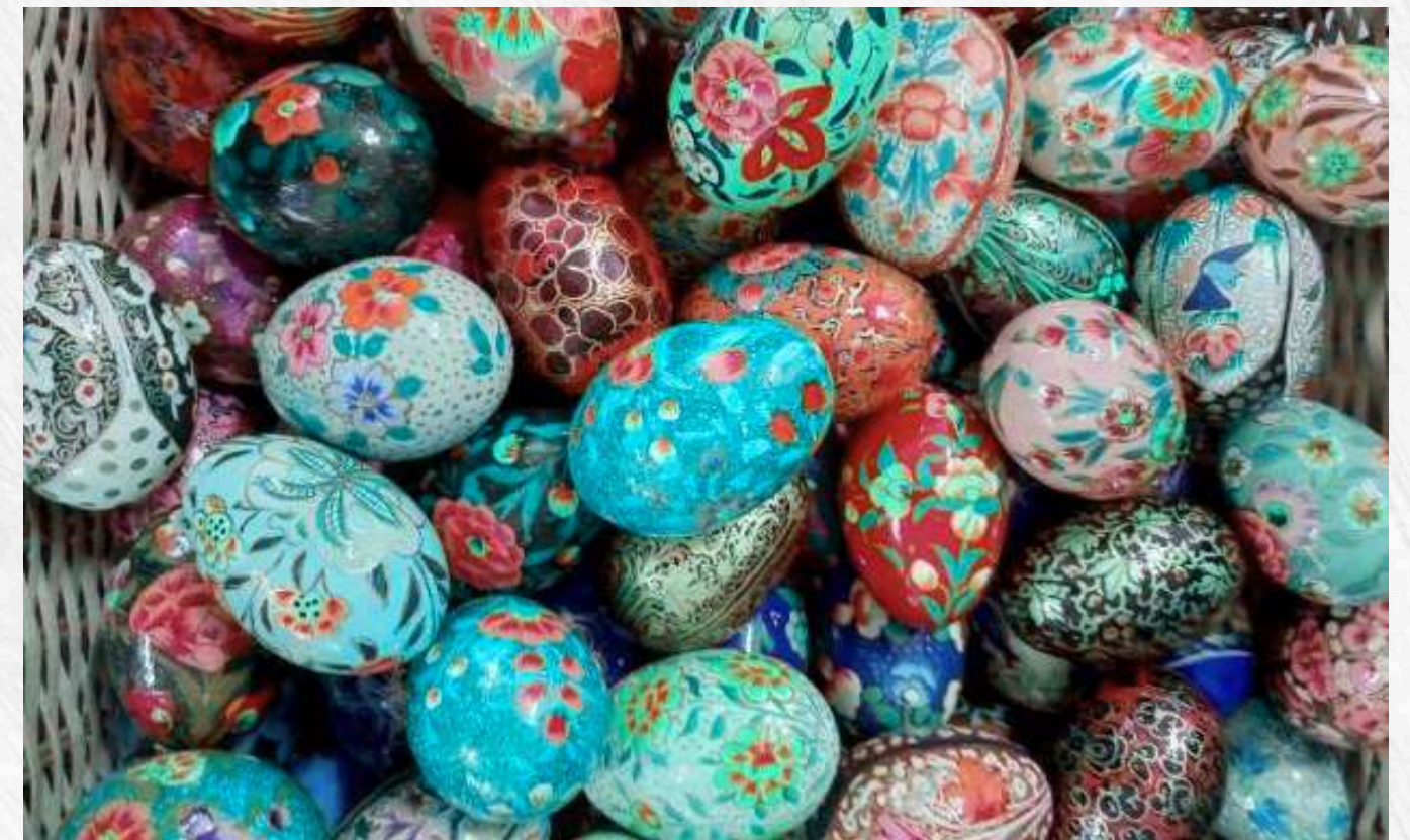
Name - Easter Eggs | Size - 7.5cm | Theme - Sustainable