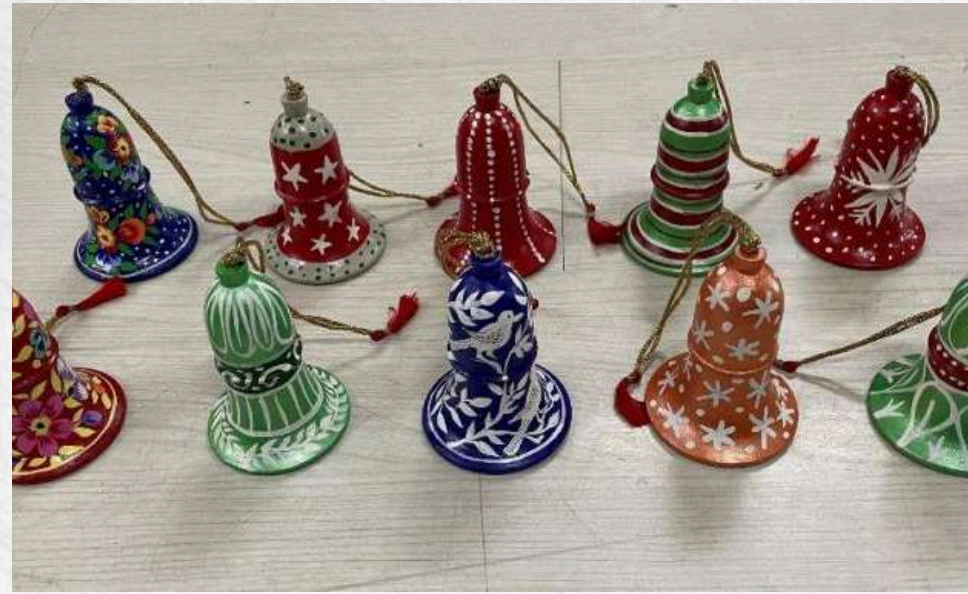
Name - Bells Size - 8cm Theme - Sustainable