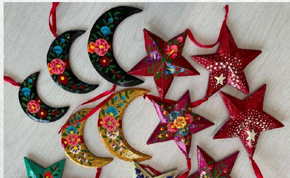
Name - Stars & Moon Size - 5 to 10cm Theme - Sustainable