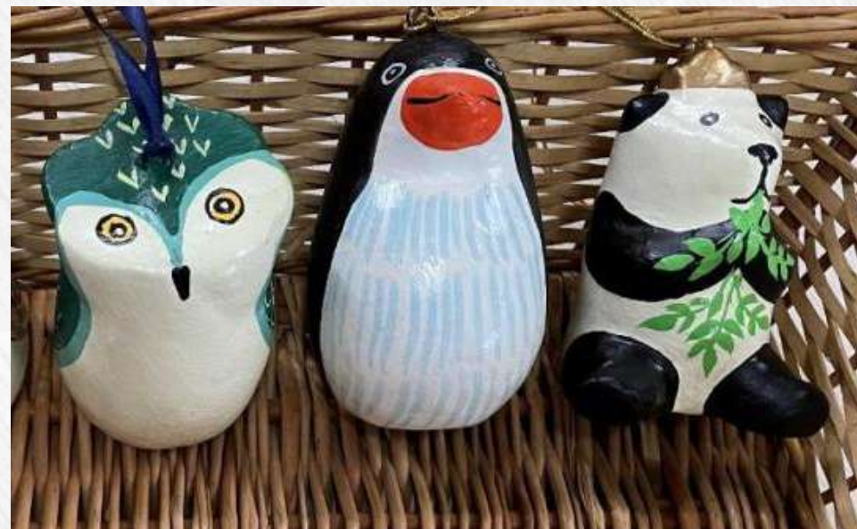
Name - Animal figures Size - 10cm Theme - Sustainable