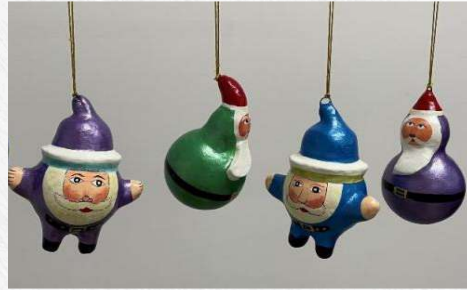
Name - Santa Size - 12cm Theme - Sustainable