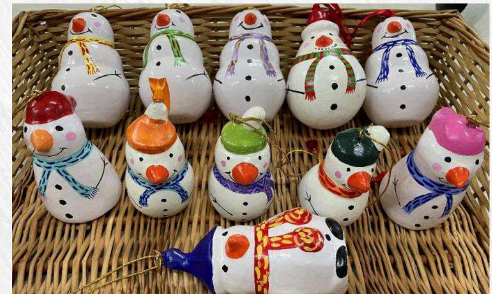
Name - Snowman Size - 10cm (big) & 8cm (small) Theme - Sustainable