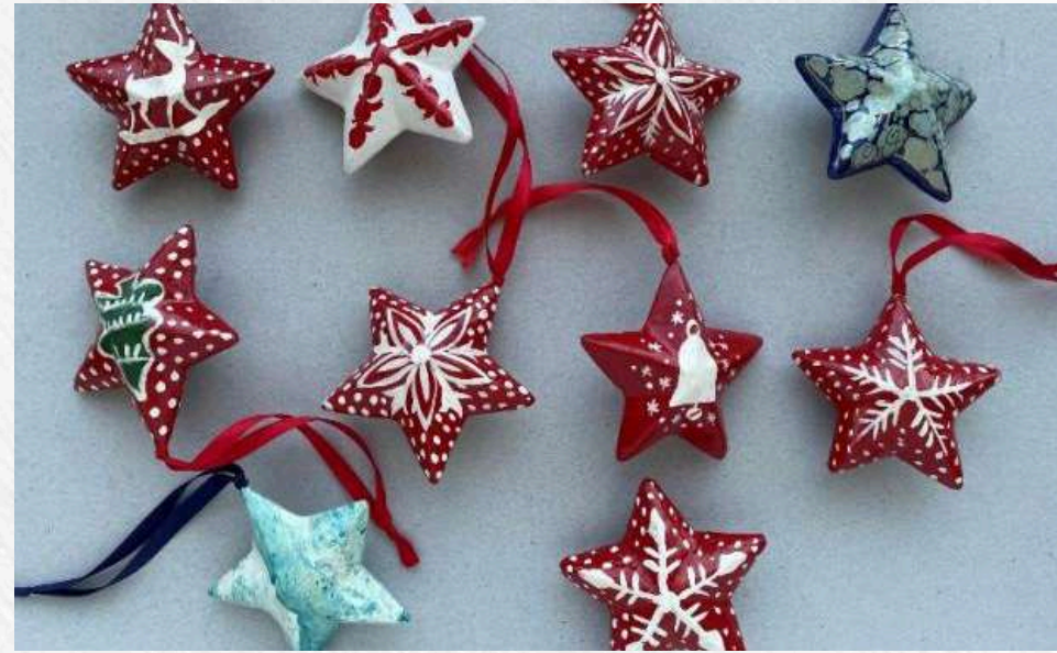
Name - Stars Size - 6cm Theme - Sustainable