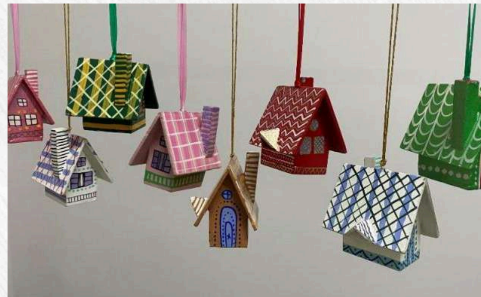
Name - Hut Size - 7cm Theme - Sustainable