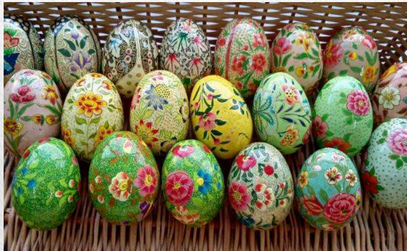
Name - Easter Eggs | Size - 7.5cm | Theme - Sustainable