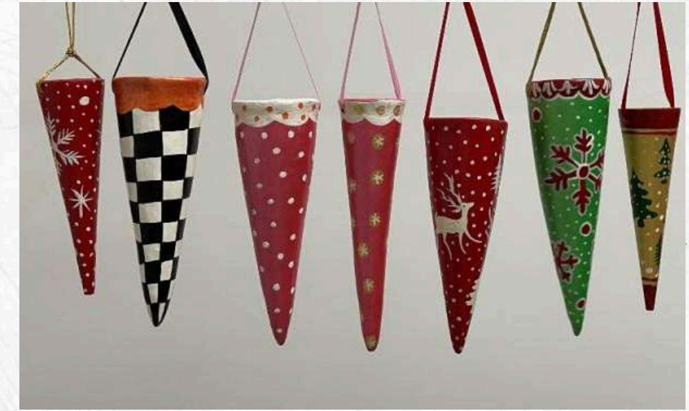
Name - Corns Size - 15cm(big) & 12cm(small) Theme - Sustainable