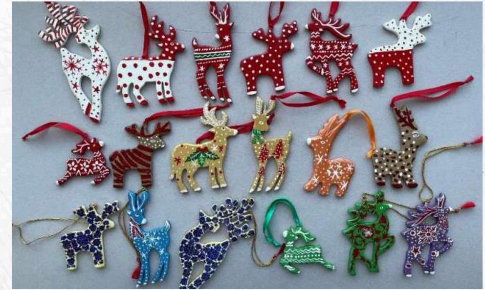
Name - Deers Size - 7 to 12cm Theme - Sustainable