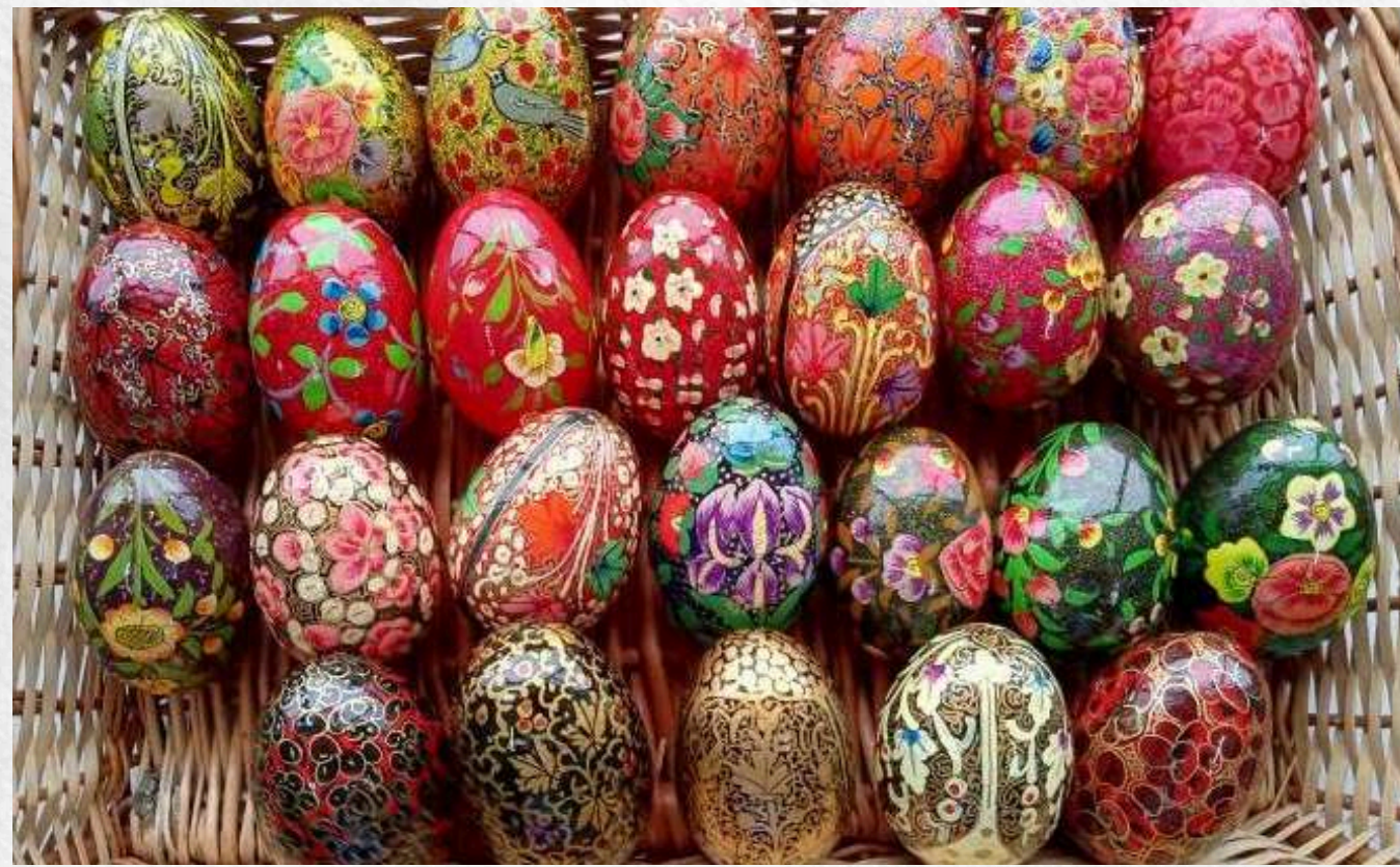
Name - Easter Eggs | Size - 7.5cm | Theme - Sustainable

Made from recycled and natural materials, these creations feature playful designs and timeless motifs, allowing you to celebrate in style while being environmentally conscious.