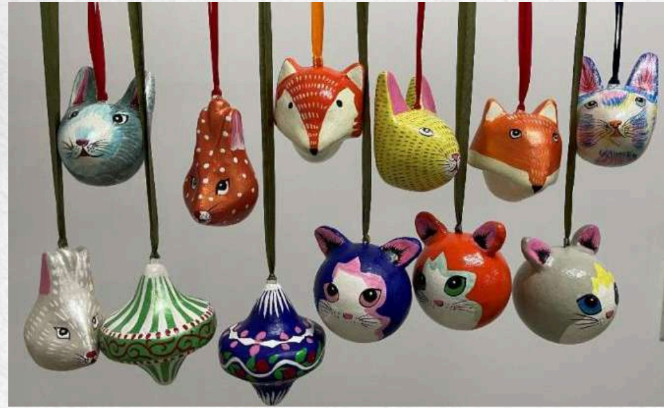
Name - Animal Face Size - 8cm Theme - Sustainable