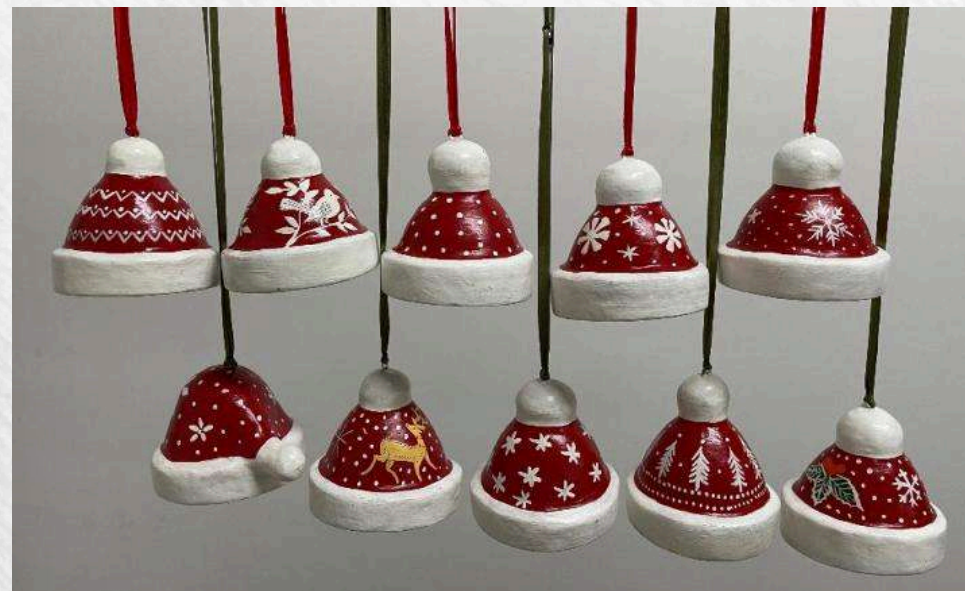
Name - Caps Size - 7.5cm Theme - Sustainable